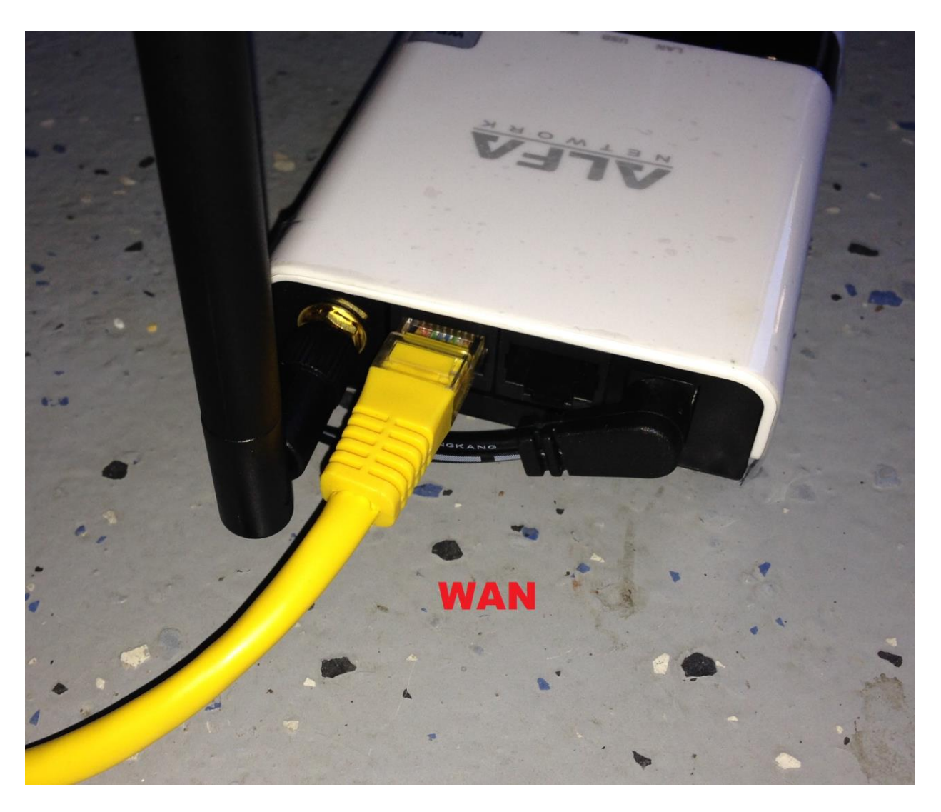
Disconnect the Yellow Cable from your PC and connect it to R36 WAN Port. Please note you must change your IP setting back to Dynamic before you do that.